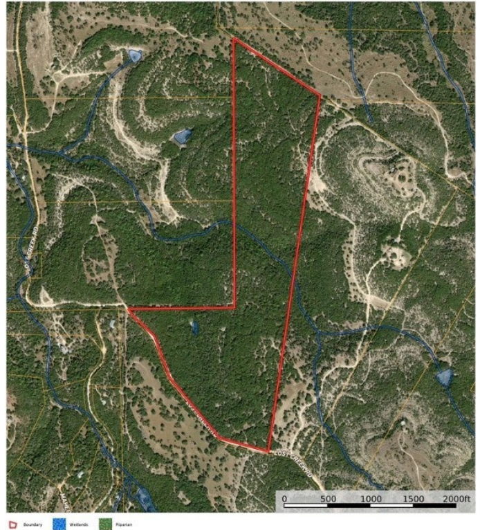
Lost Creek Ranch Hays County, Texas, 100.301 AC +/-

The Lost Creek Ranch is a stunning unrestricted 100.301 +/- acre property conveniently located to both Dripping Springs and the Lake Travis area. Mostly untouched with potentially amazing hill country views and varied topography the Lost Creek Ranch provides a blank canvas for your homesite, recreational activities or future development. Wet weather creek on property. Utilities: There are 2 electric poles on the property with no meter, well & septic needed. Well estimates available. Property is not currently ag exempt. Lost Creek road is a private road for the use of the property owners and is a deeded easement fenced on both sides of the road. Metal shed/barn and previous structure also exist on property.