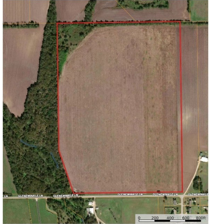
80 AC Glenewinkel RD Seguin, TX Guadalupe County, Texas, 80 AC +/-

Approximately 75 of the 80 acres is fertile and tillable. Exceptional soils and flat as a tabletop, easy to farm! Current crop is subject to a crop share lease agreement and does not convey. Subject property lies within the Seguin City Limits. Springs Hill Water Supply Corporation is available, but not on subject property. Buyer advised to complete due diligence. NO INTERMEDIARY.